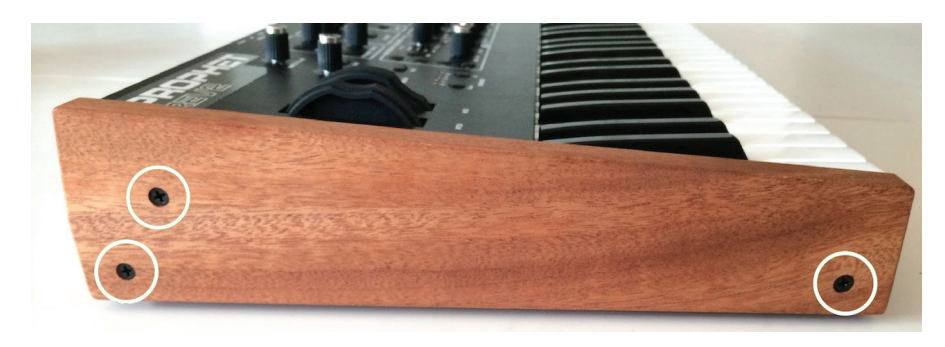
Remove the 3 screws from both the right and left wooden sides