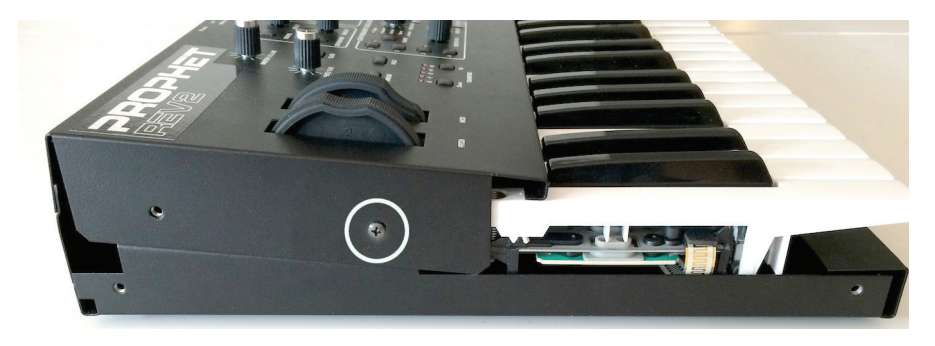
Remove the single screw on the both the right and left sides of the metal case