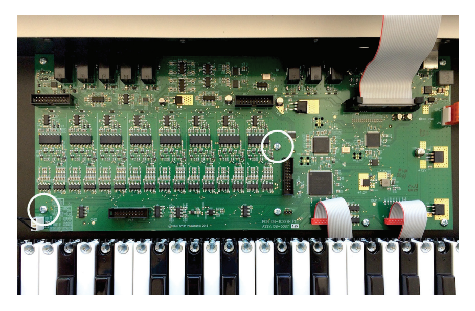
Remove the 2 screws from the main board as shown above