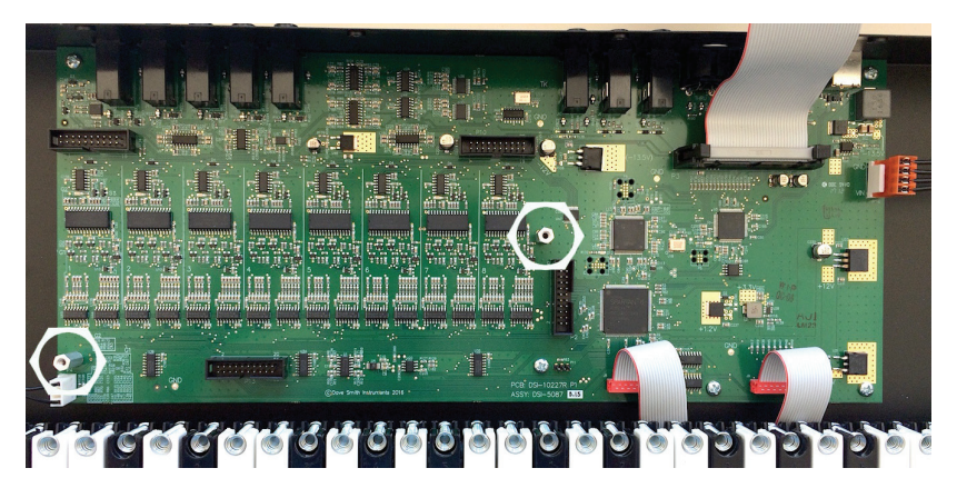
Using a 1/4" nut driver or a small crescent wrench, install the standoffs in place of the 2 screws.